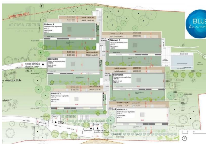
HARMONY avenue des Diables Bleus