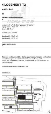
HARMONY avenue des Diables Bleus 6360

Date: 03/03/2021 Indice: A échelle: 1:50