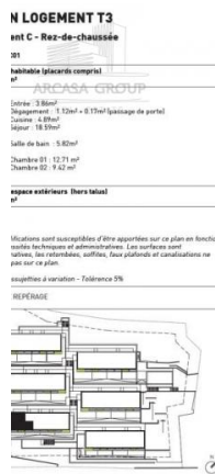
HARMONY avenue des Diables Bleus 6360